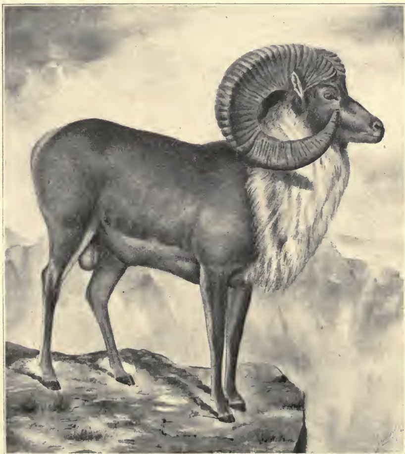
FIG. XXII. OVIS AMMON. ARGALI.

Zoöl. Ser. Id. Check-L. Mamm. N. Amer. Cont. & W. Indies, F. C. M. Pub., VI, 1905, p. 55. Zoöl. Ser.